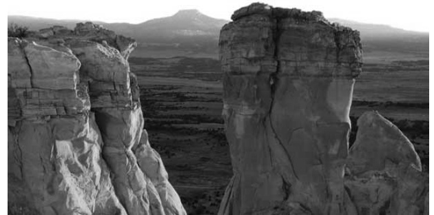
Typical view from Ghost Ranch

Ghost Ranch has many arts and outdoor adventure programs for adults and children, so you can take the whole family.