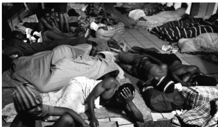
Zimbabwean refugees sleep on the floor of the Central Methodist Mission in Johannesburg