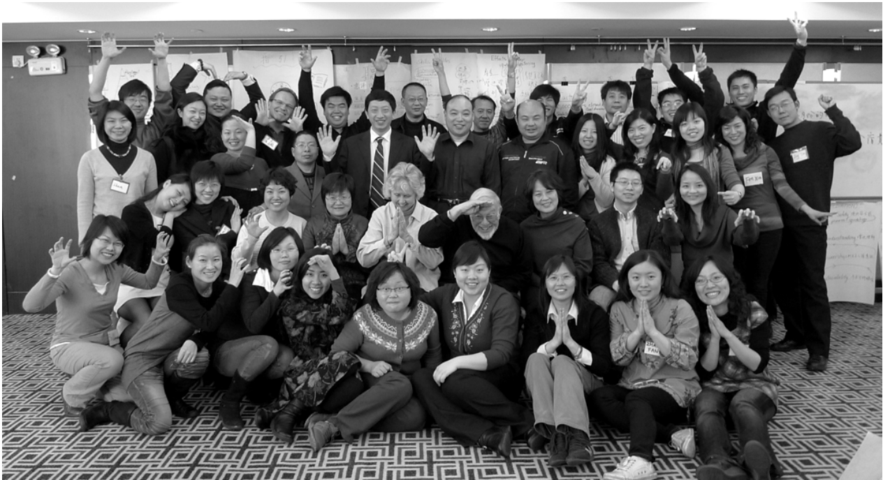
Beijing workshop participants adopt symbols from one of the learning exercises in conflict transformation.